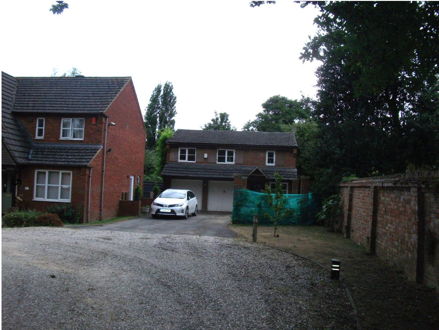
3 David Nicholls Close and Garage